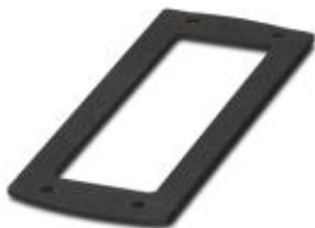
The photo shows size B16