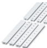
Zack marker strip, can be ordered: Strip, white, labeled according to customer specifications, Mounting type: Snap into tall marker groove, for terminal block width: 10.2 mm, Lettering field: 10.15 x 10.5 mm