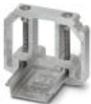
End clamp, for end support of UKH 50 to UKH 240, is pushed onto DIN rail NS 35 and fixed with 2 screws, width: 10 mm, color: aluminum