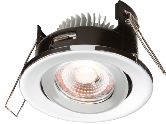
Shown with Bezel (not included)