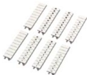
Zack marker strip, 10-section, horizontally labeled with the consecutive numbers: 301 ... 310, white, Width: 5 mm

Please be informed that the data shown in this PDF Document is generated from our Online Catalog. Please find the complete data in the user's documentation. Our General Terms of Use for Downloads are valid ( http://download.phoenixcontact.com )