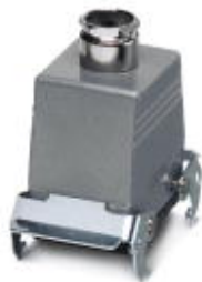
Coupling housing, with double locking latch, height 76 mm, with screw connection, 1x Pg21

Please be informed that the data shown in this PDF Document is generated from our Online Catalog. Please find the complete data in the user's documentation. Our General Terms of Use for Downloads are valid ( http://phoenixcontact.com/download )