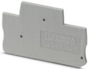
The figure shows a version of the article

End cover, Length: 69.3 mm, Width: 2.2 mm, Color: gray