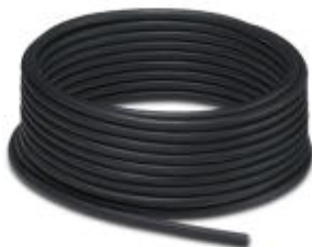
Cable ring, halogen-free PUR, black, 8-pos., conductor colors: White / brown / green / yellow / gray / pink / blue / red, cable length: 100 m

Please be informed that the data shown in this PDF Document is generated from our Online Catalog. Please find the complete data in the user's documentation. Our General Terms of Use for Downloads are valid ( http://phoenixcontact.com/download )