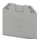
End cover, Length: 52.8 mm, Width: 2.2 mm, Height: 47.3 mm, Color: gray