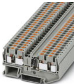
Component terminal block, Connection method: Push-in connection, Cross section: 0.2 mm 2 - 6 mm 2 , AWG: 24 - 10, Width: 6.2 mm, Color: gray, Mounting type: NS 35/7,5, NS 35/15

Please be informed that the data shown in this PDF Document is generated from our Online Catalog. Please find the complete data in the user's documentation. Our General Terms of Use for Downloads are valid ( http://phoenixcontact.com/download )