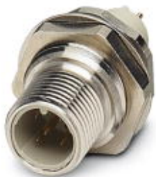
Sensor/Actuator flush-type plug, 5-pos., M12, A-coded, rear/screw mounting with Pg9 thread, with straight solder connection

Please be informed that the data shown in this PDF Document is generated from our Online Catalog. Please find the complete data in the user's documentation. Our General Terms of Use for Downloads are valid ( http://phoenixcontact.com/download )