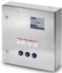
Combination lightning arrester and TVSS system for ungrounded 480 V Delta systems

Please be informed that the data shown in this PDF Document is generated from our Online Catalog. Please find the complete data in the user's documentation. Our General Terms of Use for Downloads are valid ( http://phoenixcontact.com/download )