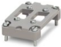
D-SUB adapter plate, for two D-SUB connectors, no. of positions 9, housing series HC-B 6...

Please be informed that the data shown in this PDF Document is generated from our Online Catalog. Please find the complete data in the user's documentation. Our General Terms of Use for Downloads are valid ( http://phoenixcontact.com/download )