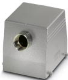
Sleeve housing, for double locking latch, height 80 mm, without screw connection, 1x Pg29, lateral cable entry

Please be informed that the data shown in this PDF Document is generated from our Online Catalog. Please find the complete data in the user's documentation. Our General Terms of Use for Downloads are valid ( http://phoenixcontact.com/download )