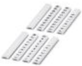
Zack Marker strip, flat, Strip, white, labeled, Printed horizontally: Consecutive numbers 1 - 10, 11 - 20, etc. up to 491 - 500, Mounting type: Snap into flat marker groove, for terminal block width: 5 mm, Lettering field: 5.15 x 5.15 mm

Zack Marker strip, flat - ZBF 5,LGS:FORTL.ZAHLEN - 0808671