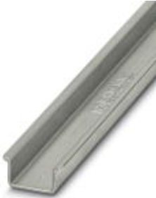
DIN rail, material: Steel, unperforated, 2.3 mm thick, height 15 mm, width 35 mm, length: 2 m

Please be informed that the data shown in this PDF Document is generated from our Online Catalog. Please find the complete data in the user's documentation. Our General Terms of Use for Downloads are valid ( http://download.phoenixcontact.com )