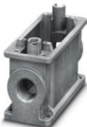
HEAVYCON ADVANCE B16 box mounting base, for M6 screw locking, salt-water-resistant aluminum, with 2 x M32 thread, without surface coating

Please be informed that the data shown in this PDF Document is generated from our Online Catalog. Please find the complete data in the user's documentation. Our General Terms of Use for Downloads are valid ( http://phoenixcontact.com/download )