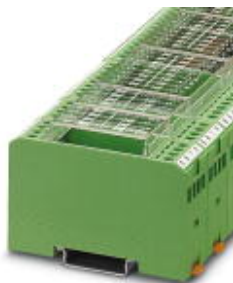
Diode module, with 7 diodes, common anode, diode type 1N 4007

Please be informed that the data shown in this PDF Document is generated from our Online Catalog. Please find the complete data in the user's documentation. Our General Terms of Use for Downloads are valid ( http://download.phoenixcontact.com )