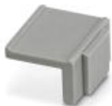
Equipment marker, width 12 mm