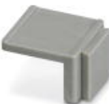
Equipment marker, narrow

Marking material - EMG-SGKS 10 - 2947585