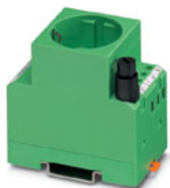
Rail-mountable socket, with glow lamp and equipment fusing 5x 20 mm to max. 6.3 A; green housing

Please be informed that the data shown in this PDF Document is generated from our Online Catalog. Please find the complete data in the user's documentation. Our General Terms of Use for Downloads are valid ( http://download.phoenixcontact.com )