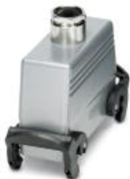
Sleeve housing, with double locking latch, height 76 mm, with screw connection, 1x Pg21, straight cable entry

Please be informed that the data shown in this PDF Document is generated from our Online Catalog. Please find the complete data in the user's documentation. Our General Terms of Use for Downloads are valid ( http://phoenixcontact.com/download )