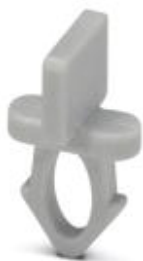
Spacer, Color: white

Please be informed that the data shown in this PDF Document is generated from our Online Catalog. Please find the complete data in the user's documentation. Our General Terms of Use for Downloads are valid ( http://phoenixcontact.com/download )