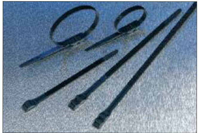
Single locking head