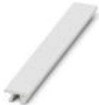
Zack marker strip, Strip, white, unlabeled, can be labeled with: Plotter, Mounting type: Snap into tall marker groove, for terminal block width: 22 mm, Lettering field: 10.5 x 21.8 mm

Zack marker strip - ZB 22:UNBEDRUCKT - 0811862