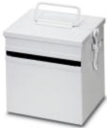
Metal box for storing SD-WMS marking collars in the form of a roll

Please be informed that the data shown in this PDF Document is generated from our Online Catalog. Please find the complete data in the user's documentation. Our General Terms of Use for Downloads are valid ( http://phoenixcontact.com/download )