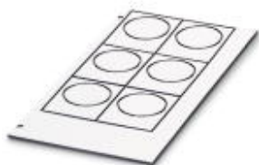
The figure shows the product version EMLP 32 (38X14)

Plastic label with drill hole, Card, black, unlabeled, can be labeled with: Engraving, Plotter, Mounting type: Adhesive, Lettering field: 30 x 12 mm