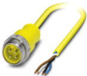
Sensor/Actuator cable, 4-position, PVC, Yellow RAL 1021, Plug straight 7/8"-16UNF, A-coded, on free cable end, Cable length: 4 m

Please be informed that the data shown in this PDF Document is generated from our Online Catalog. Please find the complete data in the user's documentation. Our General Terms of Use for Downloads are valid ( http://phoenixcontact.com/download )