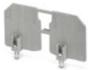
Flange cover, Length: 47 mm, Width: 4.5 mm, Height: 24.7 mm, Color: gray