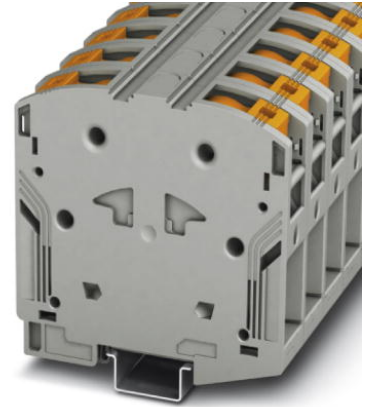
Image shows the version in gray

Feed-through terminal block, Connection method: Push-in connection, Cross section: 25 mm 2 - 95 mm 2 , AWG: 4 - 3/0, Width: 25 mm, Color: blue, Mounting type: NS 35/15