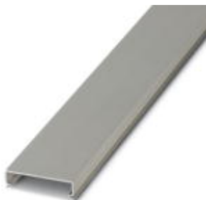
Cover for cable duct, light gray, halogen-free, width: 120 mm, length: 2000 mm

Please be informed that the data shown in this PDF Document is generated from our Online Catalog. Please find the complete data in the user's documentation. Our General Terms of Use for Downloads are valid ( http://phoenixcontact.com/download )