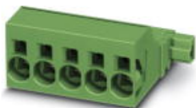
The illustration shows the 5-pos. version

Plug component, Nominal current: 76 A, Rated voltage (III/2): 1000 V, Number of positions: 8, Pitch: 10.16 mm, Connection method: Spring-cage connection, Color: green, Contact surface: Silver