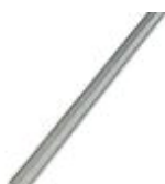
Continuous plug-in bridge, length: 500 mm, color: gray

Continuous plug-in bridge - FBST 500-PLC GY - 2966838