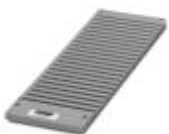
Plastic magazine for CMS-P1 plotter. Accepts 22 Zack band strips