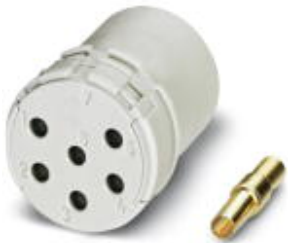
The figure shows the 6-pos. product version

Contact insert, Number of positions: 12, Type of contact: Socket, Crimp connection