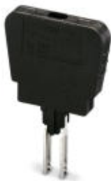
Fuse plug, Nominal current: 6.3 A, Length: 33.1 mm, Width: 6.1 mm, Height: 26.5 mm, Color: black

Please be informed that the data shown in this PDF Document is generated from our Online Catalog. Please find the complete data in the user's documentation. Our General Terms of Use for Downloads are valid ( http://phoenixcontact.com/download )