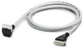
The figure shows the 14-pos. product version

Assembled round cable with two molded 20-pos. socket strips (1:1 connection). The cable has a 90° punched on connector and a 180° punched on connector, cable length: 4 m