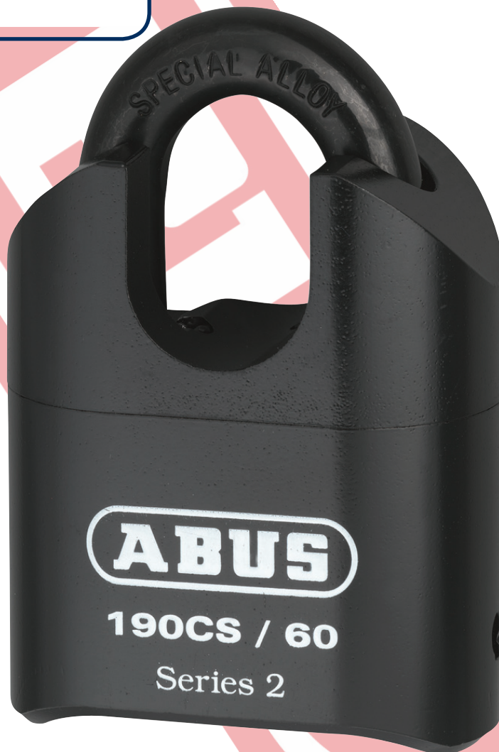
190CS/60 Combination Padlock