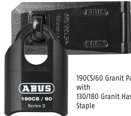
190CS/60 Granit Padlock with 130/180 Granit Hasp & Staple