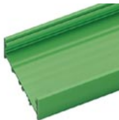
Drawn section panel mounting base, with a constructional width of 108 mm and a fixed length of 235 cm

Please be informed that the data shown in this PDF Document is generated from our Online Catalog. Please find the complete data in the user's documentation. Our General Terms of Use for Downloads are valid ( http://download.phoenixcontact.com )