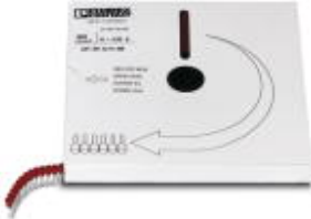
The illustration shows version AI 1,5 - 8 in red

Ferrules, 0.5 mm 2 , taped, sleeve length: 8 mm, with plastic collar, galvanically tin-plated, color: black, color range according to DIN 46228-4, CSA-certified