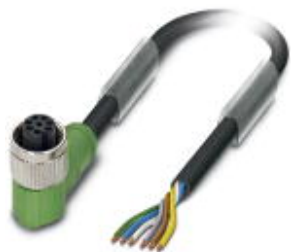
M12 socket, angled, 6-pos., with connected master cable, for sensor/actuator box with M8 slots, cable length: 5 m

Please be informed that the data shown in this PDF Document is generated from our Online Catalog. Please find the complete data in the user's documentation. Our General Terms of Use for Downloads are valid ( http://phoenixcontact.com/download )