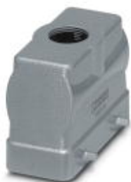
HEAVYCON B16 sleeve housing, for double locking latch, height: 65 mm, with 1 x M32 thread, straight cable outlet

Please be informed that the data shown in this PDF Document is generated from our Online Catalog. Please find the complete data in the user's documentation. Our General Terms of Use for Downloads are valid ( http://phoenixcontact.com/download )