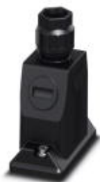
HEAVYCON ADVANCE B10 sleeve housing, with screw locking (Allen screw), plastic, height: 100 mm, with 1 x M25 thread, straight cable outlet

Please be informed that the data shown in this PDF Document is generated from our Online Catalog. Please find the complete data in the user's documentation. Our General Terms of Use for Downloads are valid ( http://download.phoenixcontact.com )