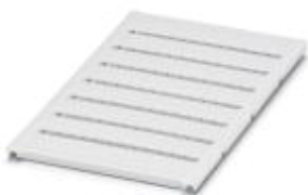
The figure shows a similar product

Marker for terminal blocks, Sheet, white, Unlabeled, Can be labeled with: BLUEMARK CLED, BLUEMARK LED, Plotter, Mounting type: Snap into tall marker groove, Lettering field: 5 x 7 mm