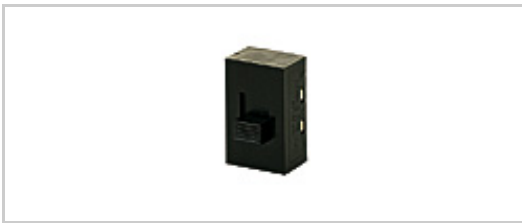
Similar to original product