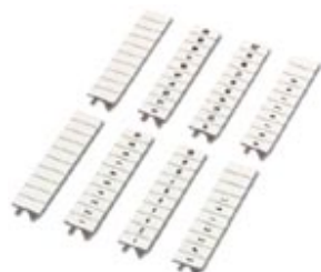
Zack marker strip, 10-section, horizontally labeled with the consecutive numbers: 111 ... 120, white, Width: 5 mm

Please be informed that the data shown in this PDF Document is generated from our Online Catalog. Please find the complete data in the user's documentation. Our General Terms of Use for Downloads are valid ( http://download.phoenixcontact.com )