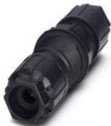
Cable connector panel feed-through, two-sided with QPD nut, black, 3+ PE pos., 1.0 mm 2 ... 2.5 mm 2 /630 V/20 A, for cable diameters of 9 mm ... 14 mm.

Please be informed that the data shown in this PDF Document is generated from our Online Catalog. Please find the complete data in the user's documentation. Our General Terms of Use for Downloads are valid ( http://phoenixcontact.com/download )