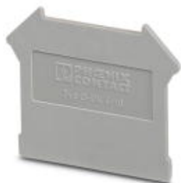
End cover, Length: 42.5 mm, Width: 1.8 mm, Height: 35.9 mm, Color: gray

Please be informed that the data shown in this PDF Document is generated from our Online Catalog. Please find the complete data in the user's documentation. Our General Terms of Use for Downloads are valid ( http://phoenixcontact.com/download )