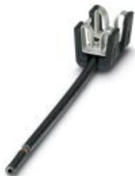
Shield connection clamp, Color: black

Please be informed that the data shown in this PDF Document is generated from our Online Catalog. Please find the complete data in the user's documentation. Our General Terms of Use for Downloads are valid ( http://phoenixcontact.com/download )