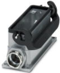
Box mounting base, with single locking latch, height 67 mm, with screw connection, 1x Pg21

Please be informed that the data shown in this PDF Document is generated from our Online Catalog. Please find the complete data in the user's documentation. Our General Terms of Use for Downloads are valid ( http://phoenixcontact.com/download )