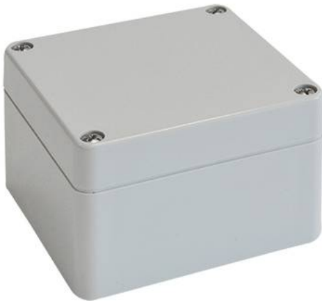
T 217 Order no.: 03217000