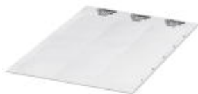
The figure shows the ESL 62X64, in white

Insert strip, Sheet, yellow, unlabeled, can be labeled with: Office printing systems, Plotter, Mounting type: Insert, Lettering field: 62 x 10 mm