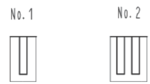
1 FIGURE-1 CONTACT No. MARKING (10:1)